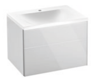
34051 Cast mineral washbasin 34050 Vanity unit