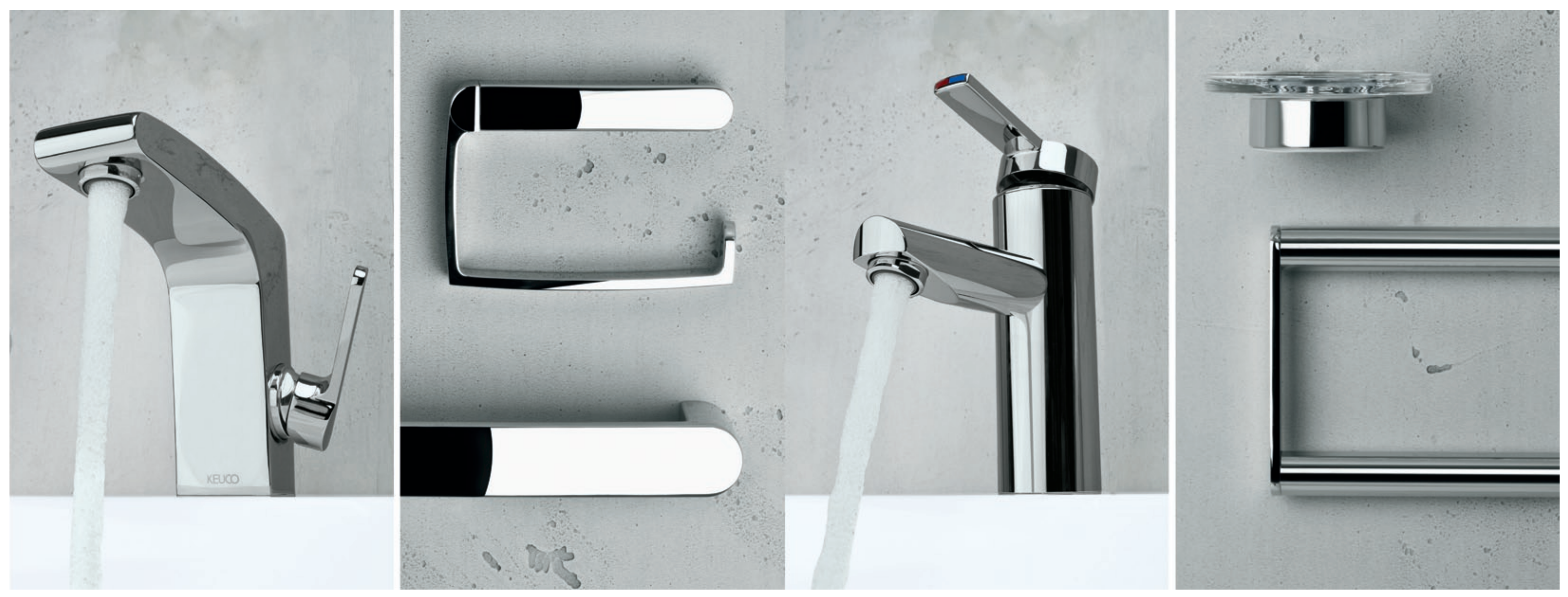
Single lever basin mixer and accessories from the ELEGANCE collection

The life blood of interior architecture is the consistency of its design. All components in the bathroom must be harmoniously coordinated to one another. Here, the perfect interplay of fittings and accessories is essential. That makes high demands on us in terms of attention to detail. But that is also what makes Keuco accessories so special.